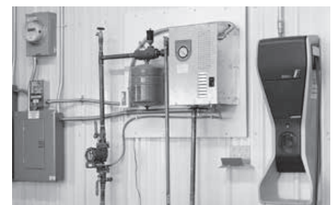
The first Level 2 electric vehicle charging station on Minnkota's demand response program was installed late last year. (Above) A 240-volt charging station (seen on far right) can fully charge a vehicle's battery in 2 to 4 hours.