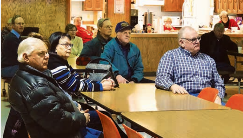
The District 8 meeting was held Jan. 30 at St. John's Lutheran School in Thief River Falls.