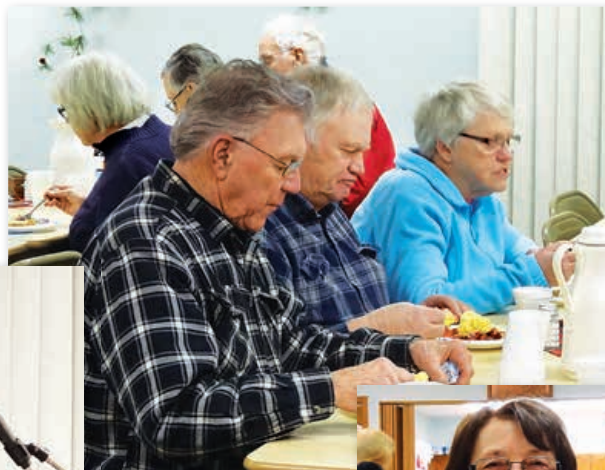
(Above) District 7 members enjoyed pie and fellowship after the meeting.

Wednesday, Jan. 31 St. Anne's Catholic Church Goodridge